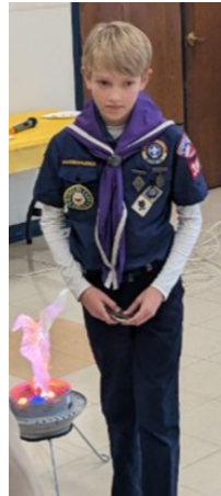
(Left:) One of the newest members of Troop 186 from Pack 3394.