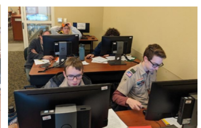
Scouts conducting research into their family history at the Midwest Genealogy Center.