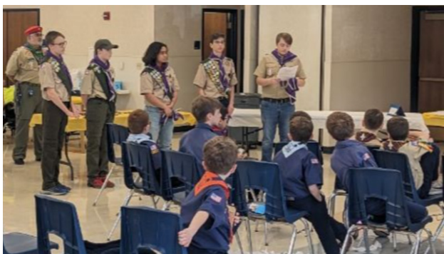
Good Shepherd Pack 3394 crossover.

While "outing" is 7/8th's of Scouting, Scouts BSA is not all about camping. Yes, the troop does camp every month, and there are lots of outdoor merit badges such as Fishing, Canoeing, Kayaking, Swimming, Nature, Weather, and Astronomy. There are merit badges, however, that involve various hobbies such as art, pottery, basketmaking, and music. In fact, there are now 139 different merit badges that Scouts can choose to earn while they are in a Scouts BSA unit.