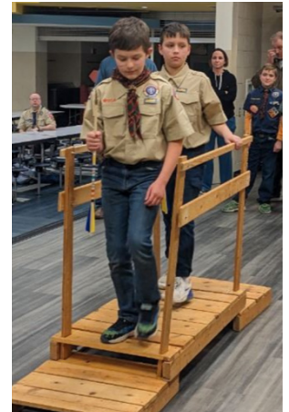
(Right:) Pack 3136 Scouts crossing over into Troop 186.

In February 2023, the Scouts from Troop 186 chose to work on their Genealogy Merit Badge during their campout. Camping out on Friday night at Lake Jacomo, the Scouts cooked breakfast early and then went to the Midwest Genealogy Center in Independence, Missouri. They then used the resources there to track their family's heritage. Each Scout needed to make a complete "family tree" that encompassed 3 generations of their family, including themselves as the 3rd generation. The Scouts needed to create 2 family group record forms. One would show them and the rest of their immediate family, and the second one would show one of their parents as a child. The Scouts also learned the terms associated with genealogy, created a timeline for themselves, and interviewed an older relative about the family they remember. The reason for the visit to the genealogy center was that one of the requirements requires the Scouts to contact a professional genealogist or organization to find out what resources they have to offer.